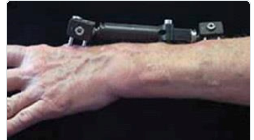
An external fixator

Open fractures. Surgery is required as soon as possible (within 8 hours after injury) in all open fractures. The exposed soft tissue and bone must be thoroughly cleaned (debrided) and antibiotics may be given to prevent infection. Either external or internal fixation methods will be used to hold the bones in place. If the soft tissues around the fracture are badly damaged, your doctor may apply a temporary external fixator. Internal fixation with plates or screws may be utilized at a second procedure several days later.