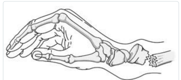
A Colles fracture occurs when the broken end of the radius tilts upward.

One of the most common distal radius fractures is a Colles fracture, in which the broken fragment of the radius tilts upward. This fracture was first described in 1814 by an Irish surgeon and anatomist, Abraham Colles -- hence the name "Colles" fracture.